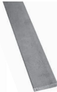
Art. 1368/19 □ 40 x 8 mm 3000 mm long 7.500 kg