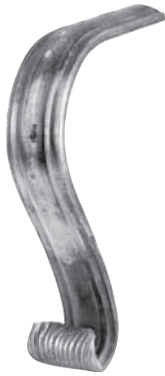
Art. 114/B/14 50 x 14 mm H = 300 x L = 110 mm To suit 114/A/3 Handrail 2.340 kg