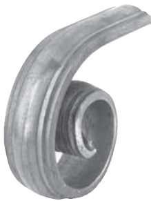
Art. 114/B/13 50 x 14 mm H = 130 x L = 130 mm To suit 114/A/3 Handrail 2.140 kg