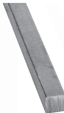
Art. 1368/4/1000 NEW □ 12 x 12 mm 1000 mm long 1.130 kg