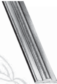
Art. 158/3/1000 □ 14 x 4 mm 1000 mm long 0.305 kg