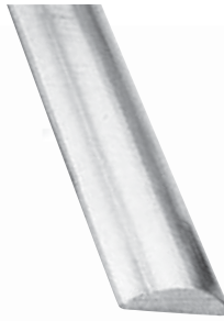
Art. 158/6/1000 □ 14 x 4 mm 1000 mm long 0.357 kg