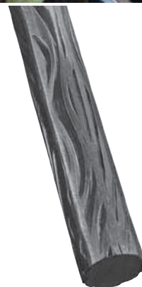
Art. 599/3 Ø 12 mm 3000 mm long 2.500 kg