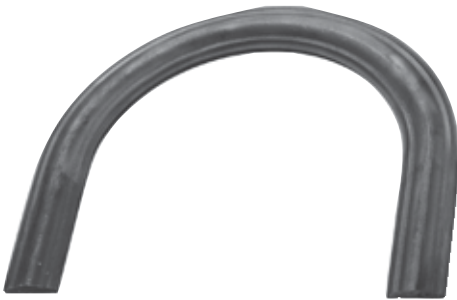
Art. 1822/1 50 x 14 mm To suit 114/A/3 handrail Diameter approx. 325 mm 3.000 kg