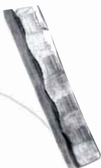
Art. 118/A/1 Hammered Bar □ 12 x 12 mm 3000 mm long 3.000 kg