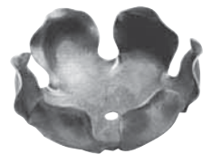
Art. 136/5 ∅ 65 mm H = 30 mm 0.3 mm 0.021 kg