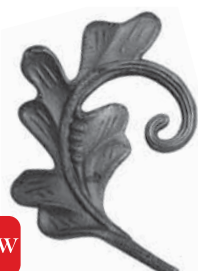
NEW Art. 663/1 ∅ 16 x 6 mm H 130 x L 100 mm 0.210 kg