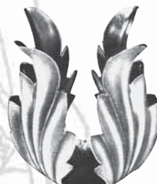
Art. 140/5 ∅ 60 x 69 mm 0.5 mm 0.040 kg