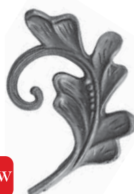
NEW Art. 663/2 ∅ 16 x 6 mm H 130 x L 100 mm 0.216 kg