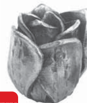
NEW Art. 140/I/3 68 mm - Ø 60 mm Thickness 1 mm 0.280 kg