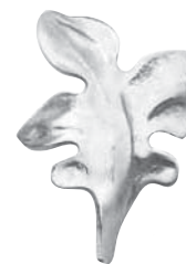
Art. 675/13 80 x 110 x 3 mm 0.096 kg