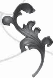
Art. 662/2 105 x 220 mm ∅ 16 x 8 mm 0.360 kg