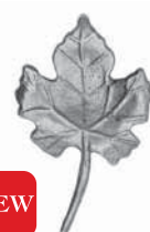
NEW Art. 661/4 ∅ 8 mm 125 x 75 mm 0.146 kg