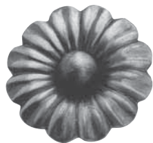
Art. 697/3 95 x 3 mm 0.220 kg