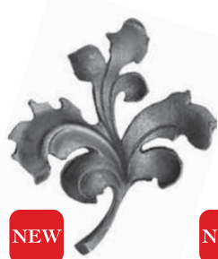
NEW Art. 661/2 ∅ 16 x 6 mm H 170 x L 140 mm 0.278 kg