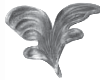
Art. 136/3 70 x 60 mm ∅ 3 mm 0.050 kg