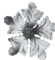
Art. 665/6 80 x 15 mm Thickness 2 mm 0.054 kg