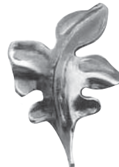
Art. 675/12 80 x 110 x 3 mm 0.096 kg