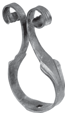
Art. 494/3 ∅ 5 mm 140 x 230 mm Hole 14 mm 0.468 kg