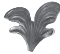
Art. 136/4 70 x 60 mm ∅ 3 mm 0.050 kg