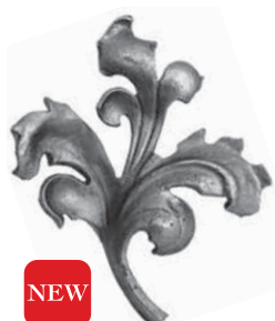
NEW Art. 661/1 ∅ 16 x 6 mm H 170 x L 140 mm 0.278 kg