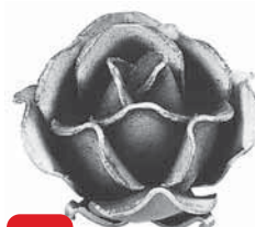
NEW Art. 700/1 45 mm - Ø 60 mm Thickness 1 mm 0.140 kg