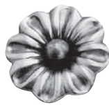
Art. 697/4 65 x 3 mm 0.088 kg