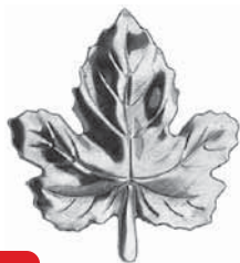
NEW Art. 709/9 56 x 54 mm Thickness 1 mm 0.004 kg