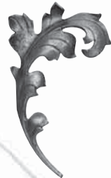
Art. 662/5 140 x 250 mm ∅ 16 x 6 mm 0.612 kg