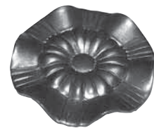
Art. 138/15 60 x 2 mm 0.048 kg