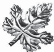
NEW Art. 138/13 195 x 190 mm Thickness 0.5 mm 0.104 kg