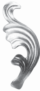
Art. 136/11 70 x 160 mm ∅ 3 mm 0.112 kg