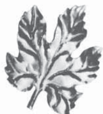
NEW Art. 138/12 105 x 95 mm Thickness 0.5 mm 0.030 kg