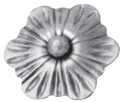
Art. 94/B/6 115 x 25 mm Thickness 4 mm 0.318 kg