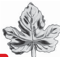
NEW Art. 709/11 72 x 72 mm Thickness 1 mm 0.010 kg