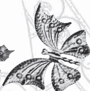
Art. 137/10 175 x 125 mm 0.5 mm 0.070 kg