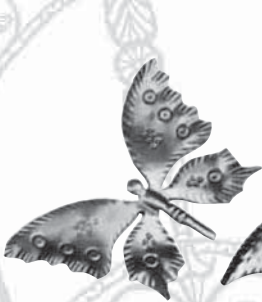
Art. 137/9 110 x 65 mm 0.5 mm 0.016 kg