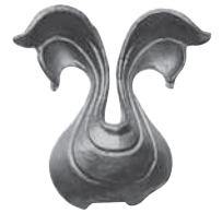
Art. 664/4 90 x 90 mm ∅ 3 mm 0.130 kg