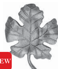
NEW Art. 661/3 ∅ 6 mm 155 x 110 mm 0.345 kg