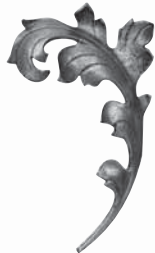
Art. 662/6 140 x 250 mm ∅ 16 x 6 mm 0.612 kg