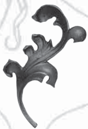
Art. 662/1 105 x 220 mm ∅ 16 x 8 mm 0.360 kg