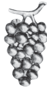
Art. 137/7 65 x 130 mm 0.5 mm 0.028 kg