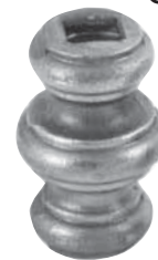
Art. 747/12 40 x 65 mm Hole Ø 12 mm 0.230 kg