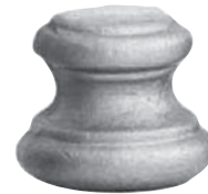
Art. 128/17 39 x 38 mm Hole Ø 12.5 mm 0.116 kg