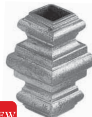
NEW *Art. 1390/5 40 x 65 mm Hole Ø 16 mm 0.216 kg