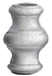
Art. 128/6 37 x 63 mm Hole Ø 12.5 mm 0.259 kg