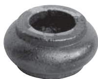
*Art. 747/4 35 x 20 mm Hole Ø 16 mm 0.038 kg