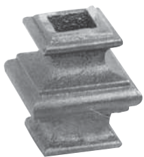
*Art. 746/1 37 x 41 mm Hole Ø 12 mm 0.150 kg