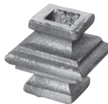
*Art. 746/3 45 x 48 mm Hole Ø 16 mm 0.250 kg