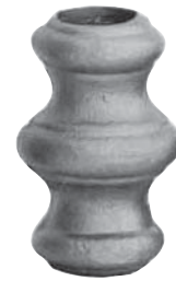
Art. 128/9 43 x 65 mm Hole Ø 16.5 mm 0.296 kg