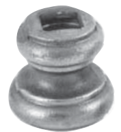
Art. 747/15 39 x 39 mm Hole Ø 12 mm 0.140 kg