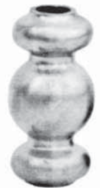
Art. 155/2 30 x 65 mm Hole Ø 12 mm 0.070 kg