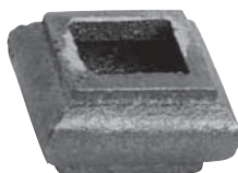
*Art. 747/3 34 x 20 mm Hole Ø 16 mm 0.052 kg