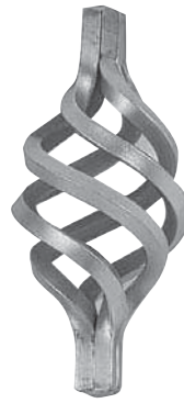
Art. 159/1 8 x 8 mm 35 x 90 mm 0.056 kg