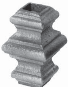
*Art. 746/5 NEW 40 x 65 mm Hole Ø 14 mm 0.200 kg